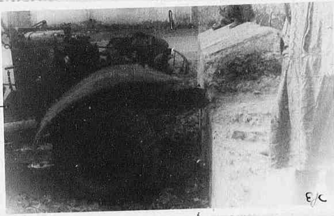
VIEW FROM RIGHT SIDE

G. STAKE, 31082156, A. C. C., IN SQUINZANO, ITALY, AT 0900 HOURS, 12 Nov 1943