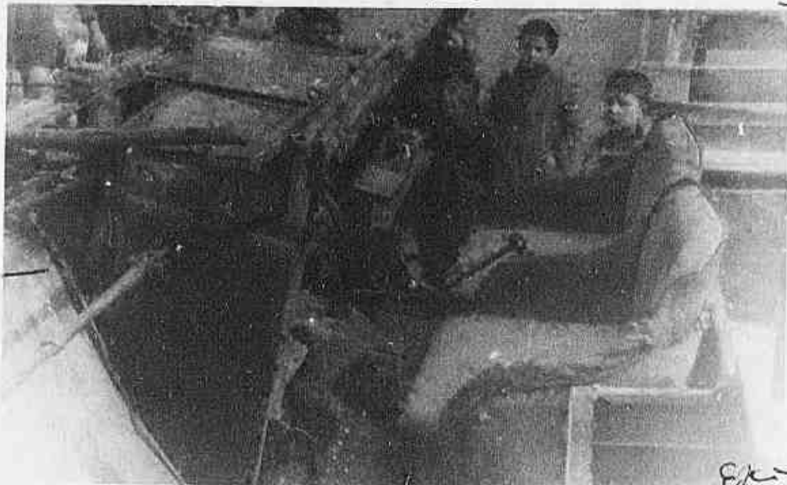
SIDE VIEW OF TRUCK

CERTIFIED TRUE COPIES OF ORIGINAL PHOTOS: